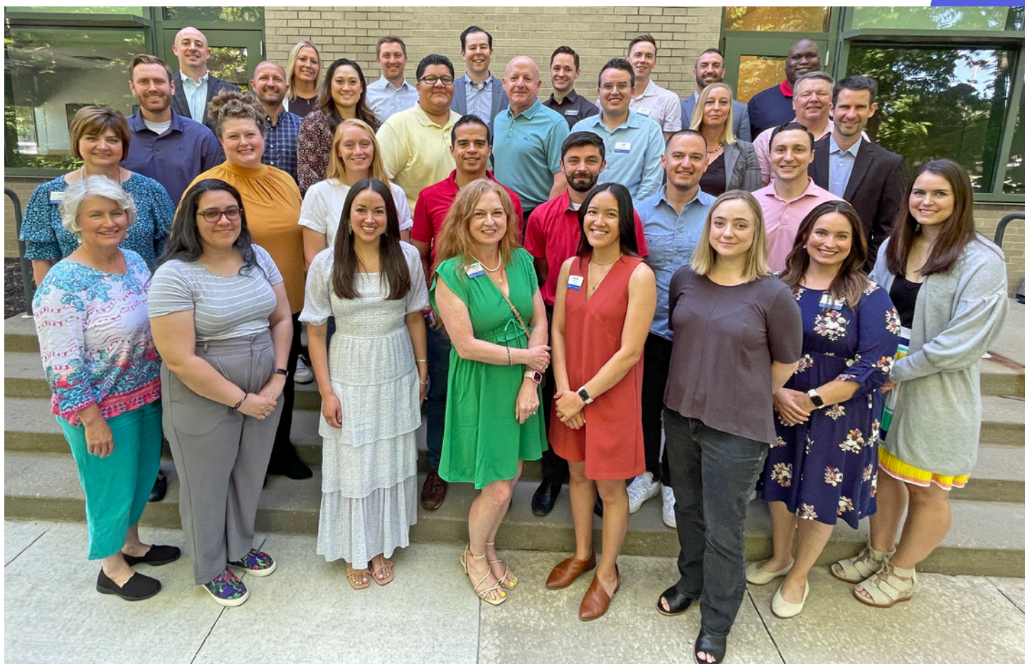
Our 41st class of the Leadership Overland Park program graduated in June.