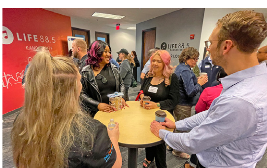
Members enjoyed networking at Wednesday Wake-up hosted by Life 88.5.