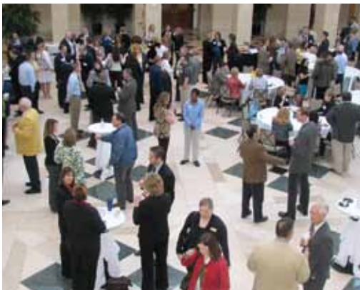
Networking in the Winter Garden at Sprint .