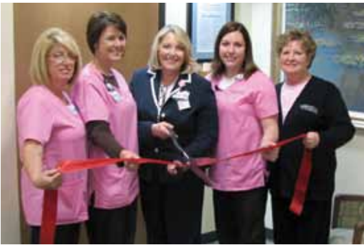
Representatives at Overland Park Regional Medical Center , 10500 Quivira Road, cut a ribbon for the new Women's Imaging Center.