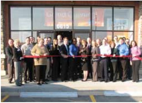
Chamber Diplomats and AT&T officials celebrated a ribbon cutting for the new AT&T Store in Corbin Park at 6615 West 135th Street.