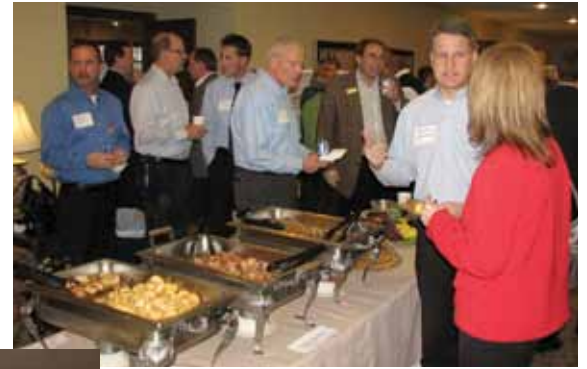
Wednesday Wrap-up attendees enjoyed a buffet of tasty appetizers.