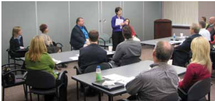
Class members heard a panel discussion on social services.