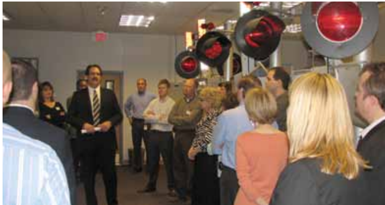
Touring the Burlington Northern Santa Fe Technical Training Center at Johnson County Community College.

On Health and Social Issues Day, the class participated in a case scenario including staff members from TLC For Children and Families, SAFE-HOME, Inc., Marillac Center, United Community Services of Johnson County and the Health Partnership Clinic . The class also heard from a health care leadership panel, which included representatives from the nursing, insurance and hospital communities. The session featured other presentations on autism, aging, and hospice and palliative care. Menorah Medical Center hosted the class and provided a tour of their facility. This month, the class will join members of Leadership Lenexa and Leadership Gardner for a session on county government and will later focus on local government and public safety on City Day.