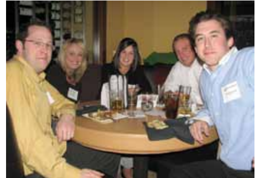
Young Professionals Reception – A table of attendees mingling at Trezo Vino Wine Bistro .